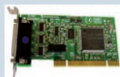
UC-049: LP uPCI 4xRS232 Opto Isolated TX RX