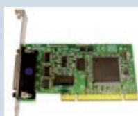
UC-072 uPCI 4xRS232 Opto Isolated TX RX