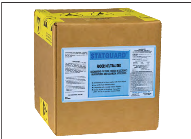
Figure 1. Statguard® Floor Neutralizer: 2.5 gallon bag-in-box