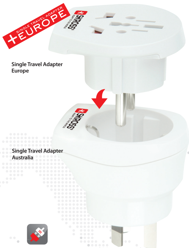
Single Travel Adapter Europe