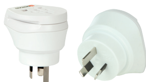
Suitable for travelers from Australia / Europe / Switzerland / UK & USA