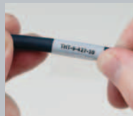
Wire Marker Labels & Sleeves