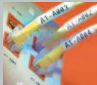
Voice & Data Communications