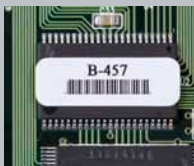
Circuit Board Labels