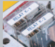
General Purpose Labels