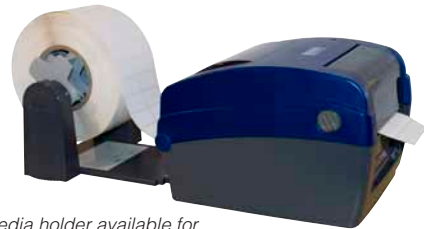
*Media holder available for larger quantity bulk 3" core rolls.

While the BBP®11 label printer primarily uses 1" core materials for low to medium volume printing, an external media holder is available for purchase should high volume printing be needed.