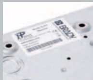
Asset Tracking Labels