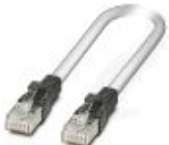
Patch cable, CAT5, assembled, 5 m

Patch cable - FL CAT5 PATCH 5,0 - 2832580