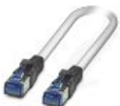
Patch cable, CAT6, pre-assembled, 20.0 m

Patch cable - FL CAT6 PATCH 20,0 - 2891576