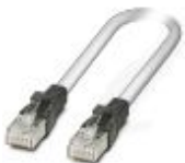
Patch cable, CAT5, assembled, 3 m

Patch cable - FL CAT5 PATCH 3,0 - 2832292