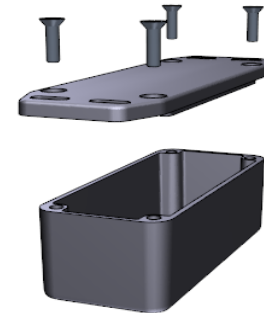
Top View Looking Inside Box