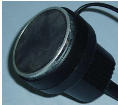
Magnet Fitted to Base