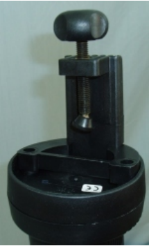
Clamp Fitted to Base