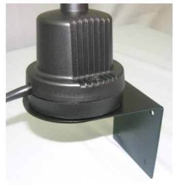
Wall Bracket Fitted to Base

EDL Lighting Limited, Redbrook lane, Brereton, Rugeley, Staffs WS15 1QU