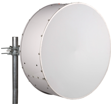
VHLPX3-26-1GR 1.0 m | 3 ft ValuLine® High Performance Low Profile Antenna, dual-polarized, 24.250–26.500 GHz, UG-595/U, gray antenna, polymer gray radome without flash, standard pack—one-piece reflector