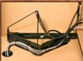
Cable Management (side view)