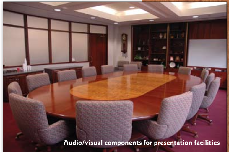
Audio/visual components for presentation facilities