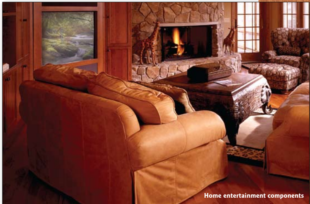
Home entertainment components