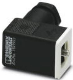
Valve connector, 4-pos., type CI, unconnected, screw connection, cable screw connection Pg7

Please be informed that the data shown in this PDF Document is generated from our Online Catalog. Please find the complete data in the user's documentation. Our General Terms of Use for Downloads are valid ( http://phoenixcontact.com/download )