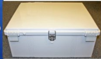
STYLE B WITH PLASTIC LATCHES AND STAINLESS STEEL PADLOCKABLE LATCH