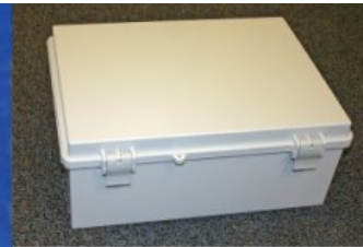
STYLE A WITH PLASTIC LATCHES