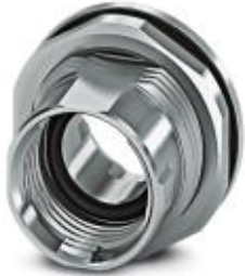
Housing screw connection, Socket, M12-SPEEDCON, Rear mounting, M15 x 1

Please be informed that the data shown in this PDF Document is generated from our Online Catalog. Please find the complete data in the user's documentation. Our General Terms of Use for Downloads are valid ( http://phoenixcontact.com/download )