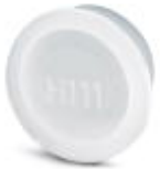
Plastic dust protection cap for connectors with M17 knurled nuts and M17 Speedcon knurled nuts

Plastic dust protection cap - ST-Z0007 - 1607777