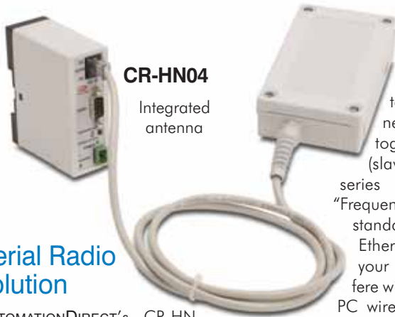
CR-HN04 Integrated antenna