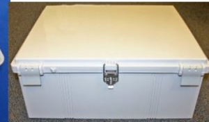
STYLE B WITH PLASTIC LATCHES AND STAINLESS STEEL PADLOCKABLE LATCH