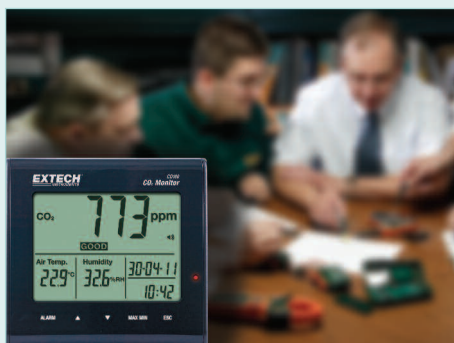
Desktop Carbon Dioxide (CO 2 ) Meter monitors the air quality in conference rooms insuring proper air ventilation