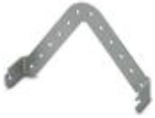
Table leg/vehicle bracket with mounting option for scanner bracket for the VMT 9000 with 10.4" display (1024 x 768), as well as for the VMT 7000 und VMT 8000 series. Mounting width: 233 mm.