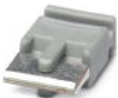
Single plug-in bridge, Length: 6 mm, Number of positions: 2, Color: gray

Single plug-in bridge - FBST 6-PLC GY - 2966825