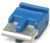
Single plug-in bridge, Length: 6 mm, Number of positions: 2, Color: blue

Single plug-in bridge - FBST 6-PLC BU - 2966812