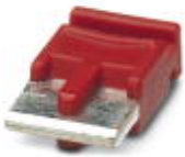
Single plug-in bridge, Length: 6 mm, Number of positions: 2, Color: red

Single plug-in bridge - FBST 6-PLC RD - 2966236