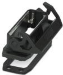
HEAVYCON EVO panel mounting base, plastic, D25, with single locking latch and flat gasket

Please be informed that the data shown in this PDF Document is generated from our Online Catalog. Please find the complete data in the user's documentation. Our General Terms of Use for Downloads are valid ( http://phoenixcontact.com/download )