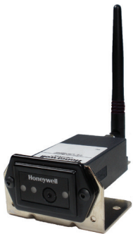
WPB1 WPMM mounting bracket