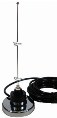
WAN10RSP straight mobile antenna, magnetic mount