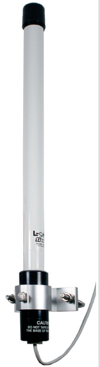
WAN06RNJ straight design, bracket mount