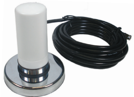
WAN09RSP low-profile mobile antenna, magnetic mount