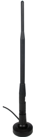
WAN05RSP & WAMM100RSP-005 T/S, magnetic mount