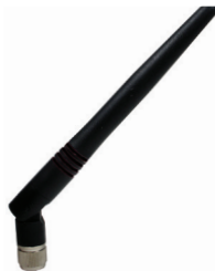
WAN02RSP tilt & swivel design, direct mount connector