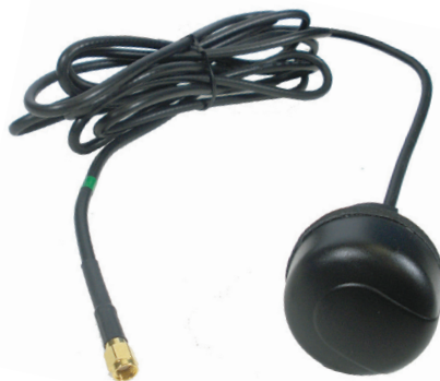
WAN11RSP low-profile dome antenna, through-hole screw mount