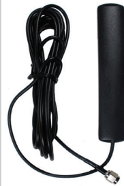
WAN03RSP flat design, adhesive mount