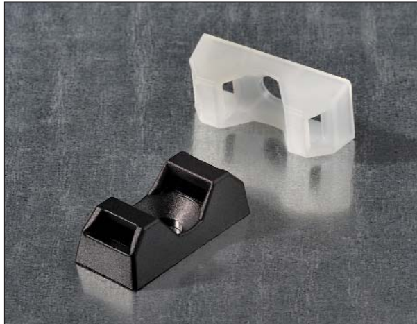
Q-mount, CTQM 2-way entry, screwable.

The Q-mount offers a perfect solution in combination with the Q-tie cable ties. It keeps the inserted cable tie in place during pre-assembly and ensures that the Q-tie does not slip out even in difficult situations, for example vertical mounting positions.