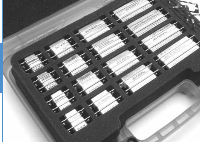
Adapter Test Kit