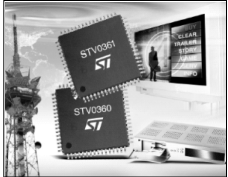
Figure 1. Package/ 64-pin TQFP