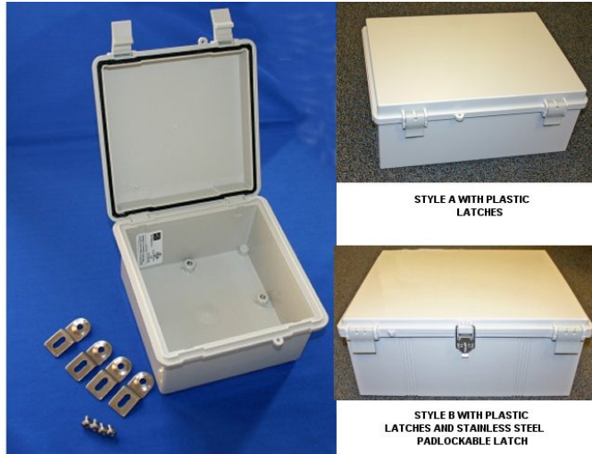
STYLE A WITH PLASTIC LATCHES