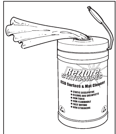
Figure 2. When separating a tissue, tear at an angle.

Lift the container cover from the canister and remove the seal from the lip of the container. Locate the first wipe in the center of the roll of wipes. Feed and push the first wipe through the hole in the center of the top cover and firmly re-attach the cover to the canister.