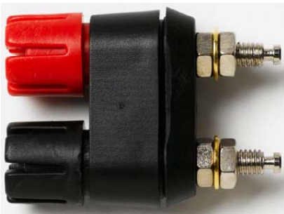
Model 6884 Dual Binding Posts with Raised Base