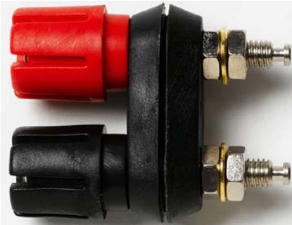
Model 6883 Dual Binding Posts