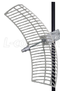
Tilt & Swivel Mast Mount