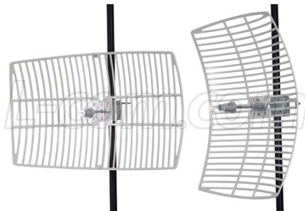
Vertical or Horizontal Polarization

The antennas' construction features a rustproof cast aluminum reflector grid for superior strength and lightweight. The 2-piece reflector grid is simple to assemble and significantly reduces shipping costs. The grid surface is UV powder coated for durability and aesthetics. The open-frame grid design minimizes wind loading. This antenna is supplied with a 60-degree tilt and swivel mast mount kit. This allows installation at various degrees of incline for easy alignment. They can be adjusted up or down from 0° to 60°.