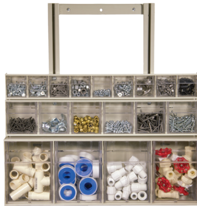
Number of Bins to Fit Each Frame