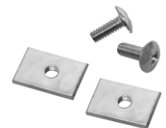
Number of Bins to Fit Each Rail Set