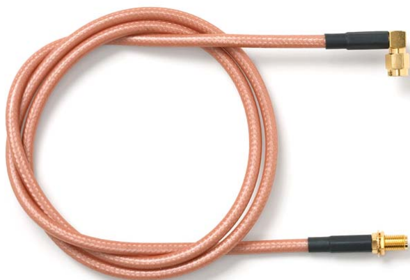
Model 73071-X SMA Right-Angle Plug to SMA Bulkhead Jack, RG142B/U

SMA Right-Angle Plug to SMA Bulkhead Jack, RG142B/U, RG316/U