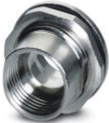
Housing screw connection, SocketLink:M12, Rear mounting, M15 x 1

Please be informed that the data shown in this PDF Document is generated from our Online Catalog. Please find the complete data in the user's documentation. Our General Terms of Use for Downloads are valid ( http://phoenixcontact.com/download )