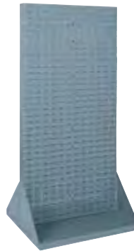
30653 Louvered Floor Rack 35 3 / 4 " L x 32" W x 75 1 / 8 " H 908 x 813 x 1908 mm. 2000 lb. capacity.