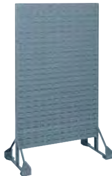
30626 Double-Sided Snap Fastener Louvered Floor Rack (Snap fasteners greatly reduce rack assembly time.) 36" L x 20" W x 60" H 914 x 508 x 1524 mm. 700 lb. capacity.

Develop a customized storage system by grouping any of our Louvered Panels.