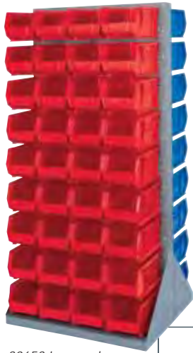
30653 Louvered Floor Rack shown with 30239 AkroBins.