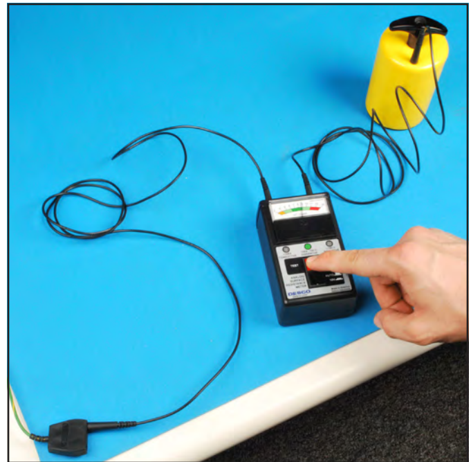
Figure 3. Using the test leads and one 5 pound electrode to measure RTG

CAUTION: If there is a current limiting resistor in the worksurface and the worksurface resistance is lower, the measurement will primarily be the resistance of the resistor. It is recommended to measure RTT particularly if the material color is black.