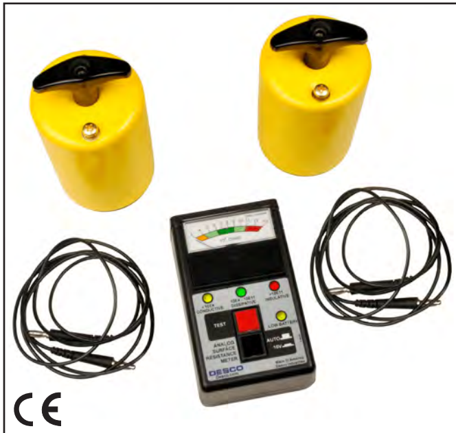
Figure 1. Desco 19784 Analog Surface Resistance Test Kit