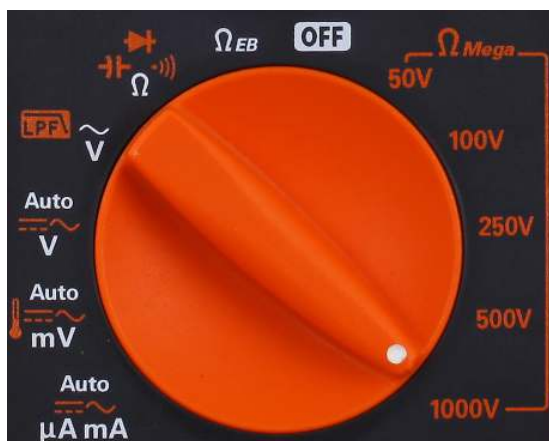
Figure 6. Insulation resistance tester with full featured DMM