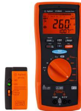
Figure 4. U1171A IR-to-Bluetooth Adapter enables wireless remote testings with the U1450A/U1460A series