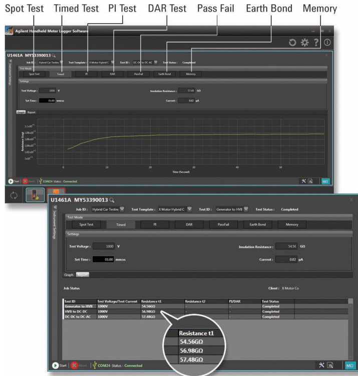
Job Status Reporting View