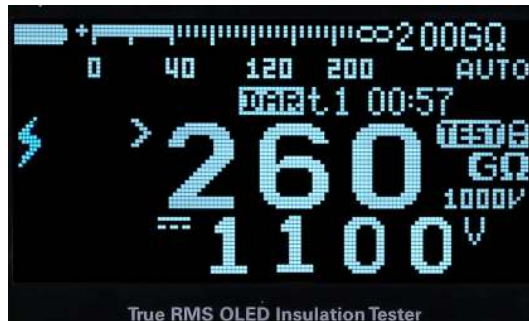
Figure 5. Adjustable insulation test voltage up to 1.1 kV

The adjustable insulation test voltage from 10 V to 1.1 kV in 1 V steps on selected two models 1 allows you to set precise test voltages catered to unique test application requirements. These typical applications are commercial avionics testing, military communications system testing and production line testing. The standard test voltages from 50 V to 1 kV is also available for selected models 2 .