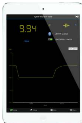
Figure 3. Data logging interface on Agilent Insulation Tester Application