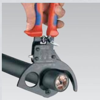
Ratchet principle and two-stage ratchet drive for easier cutting.