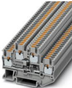
Component terminal block, Cross section: 0.14 mm 2 - 4 mm 2 , AWG: 26 - 12, Connection type: Push-in connection, Width: 5.2 mm, Color: blue, Mounting type: NS 35/7,5, NS 35/15

Please be informed that the data shown in this PDF Document is generated from our Online Catalog. Please find the complete data in the user's documentation. Our General Terms of Use for Downloads are valid ( http://phoenixcontact.com/download )