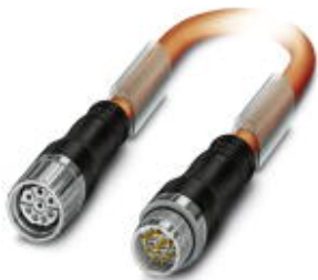
Connector in molded plastic on both sides, Length: 5 m, Color of outer sheath: orange RAL 2003

Please be informed that the data shown in this PDF Document is generated from our Online Catalog. Please find the complete data in the user's documentation. Our General Terms of Use for Downloads are valid ( http://phoenixcontact.com/download )