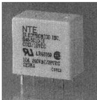
SPDT, 1 Form "C"