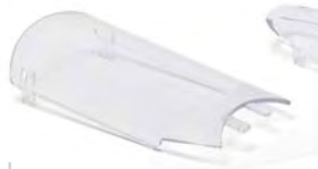
11012 X-1 Replacement Lens