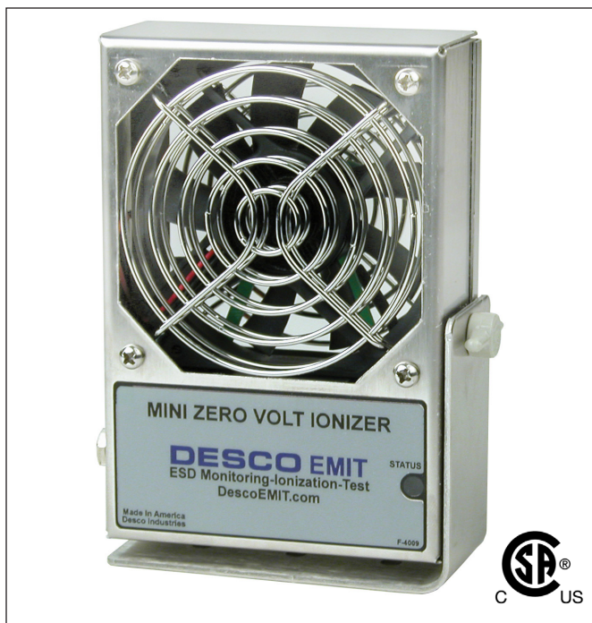
Figure 1. 50661/50640 Mini Zero Volt Ionizer