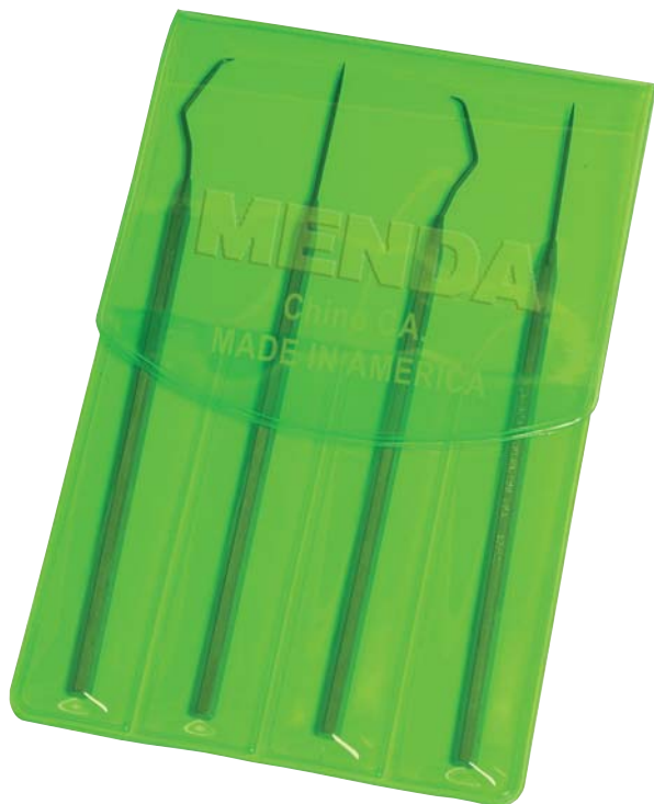
Item 35631 - KIT OF ALL FOUR PROBES IN NEON GREEN VINYL POUCH WITH INDIVIDUAL POCKETS.