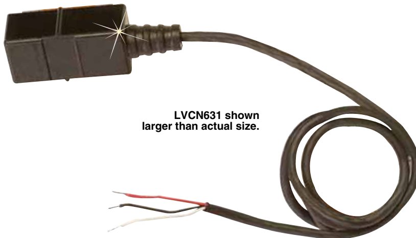
LVCN631 shown larger than actual size.