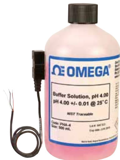
LVCN631 shown with PHA-4, both shown smaller than actual size.

The non-invasive LVCN630 Series is a cost effective ultrasonic sensor for plastic containers. The sensor is designed to adhere or strap onto the outside of a plastic containers from 51 mm (2") to 254 mm (10") with a wall thickness up to 6.35 mm (0.25") as a high/low level liquid level monitor. The sensor never comes in contact with the liquid, so there is no chance of contamination. The sensor simply sticks or clamps onto the outside of the container.