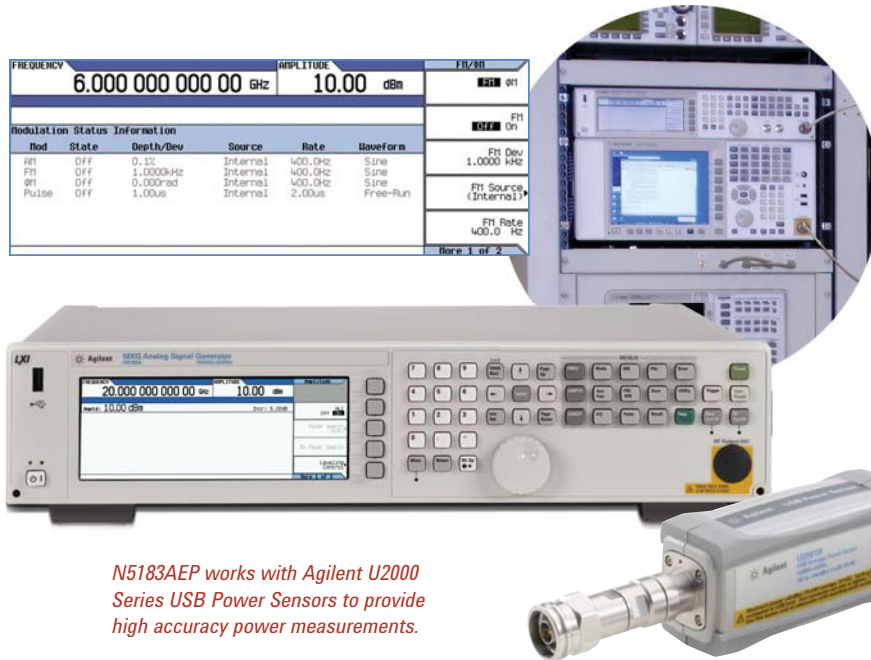
N5183AEP works with Agilent U2000 Series USB Power Sensors to provide high accuracy power measurements.

To find a distributor in your area, go to www.agilent.com/find/distributors