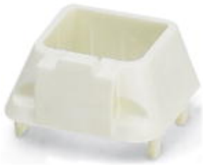
Security frame for SFN switch and patch fields, white

Please be informed that the data shown in this PDF Document is generated from our Online Catalog. Please find the complete data in the user's documentation. Our General Terms of Use for Downloads are valid ( http://phoenixcontact.com/download )