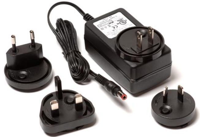
*Photo shows optional blades kit