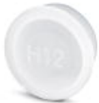
Plastic dust protection cap with IP40 eye for connectors with M23 external thread, RF, SF series

Plastic dust protection cap - SF-Z0019 - 1607449