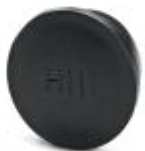
Plastic dust protection cap, anti-static, for RF, SF series connectors, with M23 external thread

Plastic anti-static dust protection cap - RC-Z2469 - 1611797