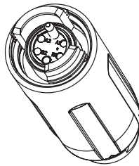
PRO BEAM* EB Cable Plug and Bulkhead Connector