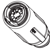
PRO BEAM Jr. EB Cable Plug and Bulkhead Connector