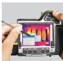
Multifunction Touch Screen