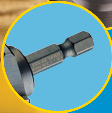
Quick change hex shank