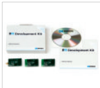
nRF24LE1 Development Kit

The nRFgo Starter Kit provides a generic development platform including motherboards with sockets for radio modules, and the nRFgo Studio evaluation PC application. The nRF24LE1 Development Kit comes in three versions: one for each package variant. These include the nRF24LE1 radio modules, complete Software Development Kit (SDK), and nRFProbe hardware debug support.