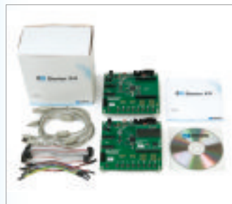
nRFgo Starter Kit

The nRF24LE1 is supported by a complete development platform enabling designers to easily develop hardware and firmware for the chip. The platform comprises two key elements: the nRFgo Starter Kit and the nRF24LE1 Development Kit. One of each is required to get started with nRF24LE1.