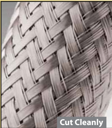
Cut Cleanly Shears